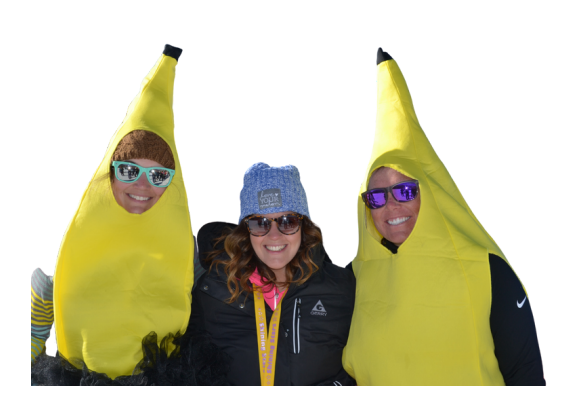
9,967 HOURS of service provided by 427 volunteers