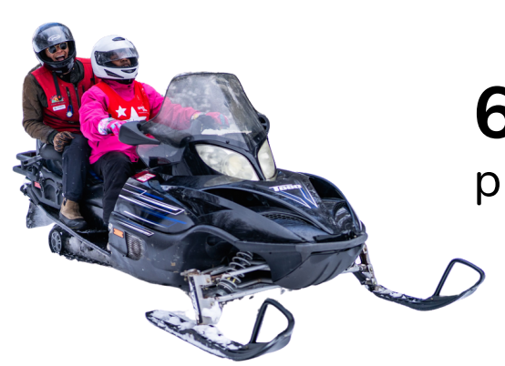
61 DAYS OF PROGRAMMING provided in 2023

served in 2023, including pediatric cancer patients, immediate family members, event attendees, and volunteers